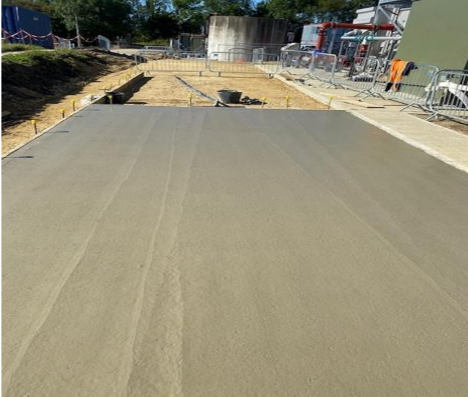
Above Ground Pipework