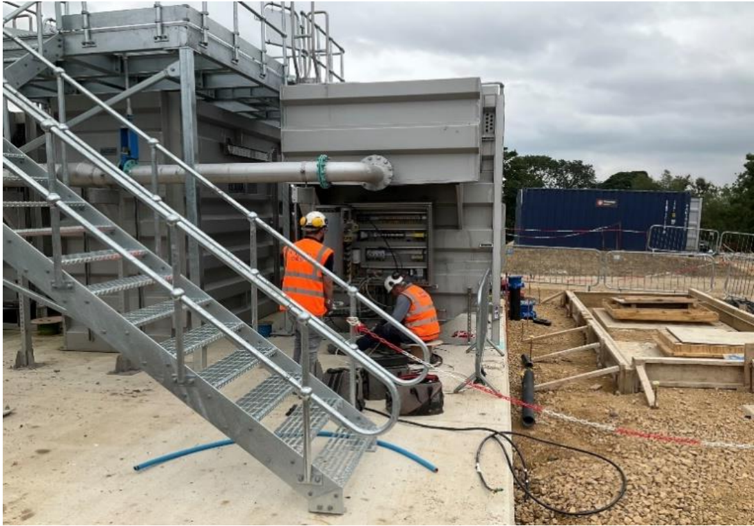
Tertiary Treatment Pipe