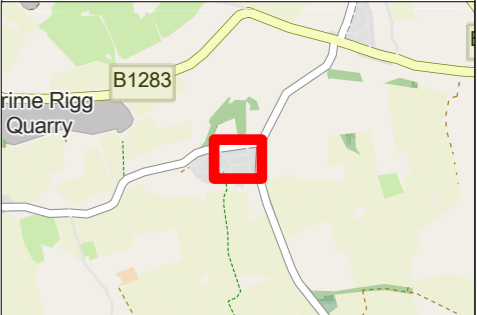
Current Version Information