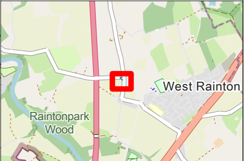
Current Version Information