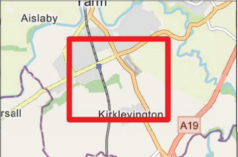
Current Version Information